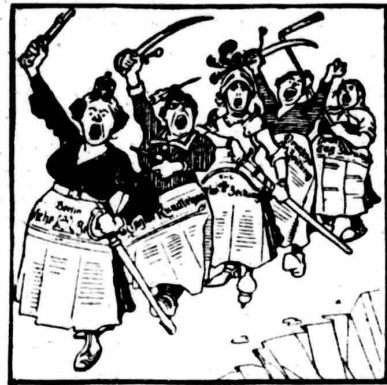
The German annexationist Press adopts a "valiant" attitude. "If we don't scare Lloyd George, then he is adamant."—(Wahre Jakob, Stuttgart.)