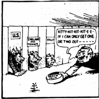
The Kaiser is an old hand at the game. But the Allied kittens are not to be caught. They know poison when they see it.—(Bristol Courier, U.S.A.)